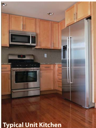
Typical Unit Kitchen